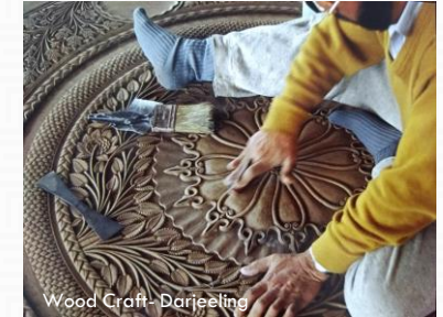
Wood Craft- Darjeeling