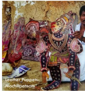
Leather Puppets- Machilipatnam