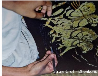
Straw Craft- Dhenkanal