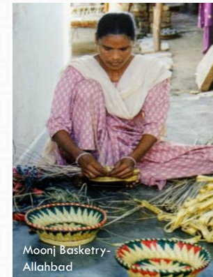
Moonj Basketry- Allahbad